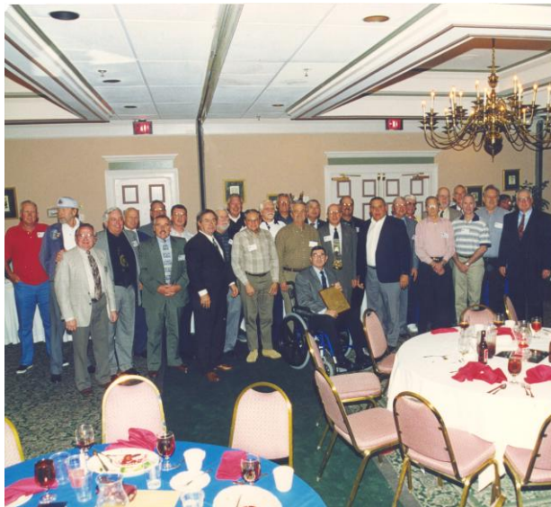
Commissioning Crew - Charleston 2000