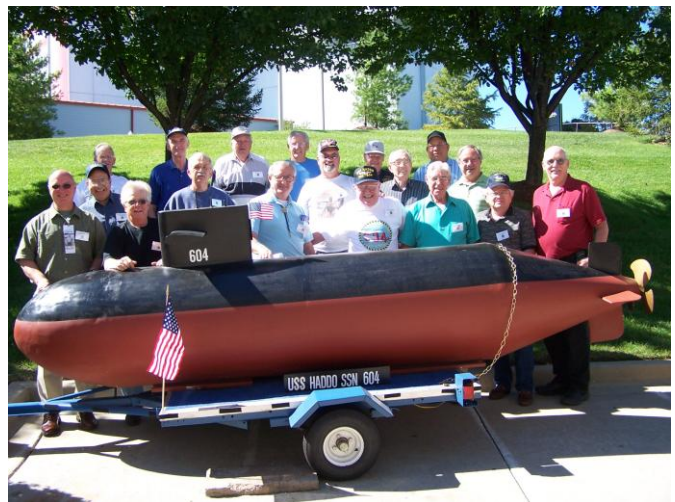
Commissioning Crew – Branson 2006

If you have not been to a Haddo reunion, you've got to make this one.