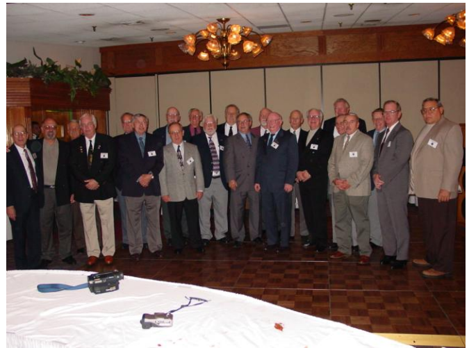
Commissioning Crew – New London 2003

This is not Haddo's first reunion; it's a crowd of attendees at the 1904 World's Fair in St. Louis. But our reunions are just as fun.