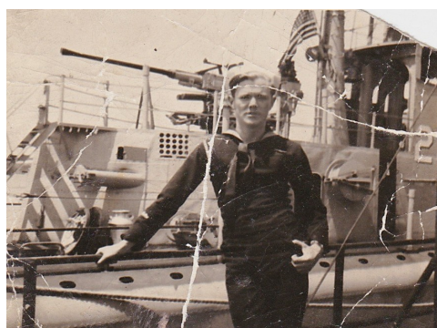
Pearl Harbor 1943